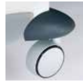
Caster with brake